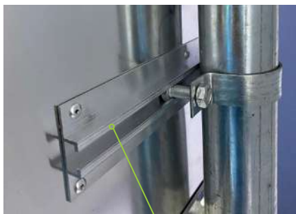
Reinforced brackets to fit standard 60mm sign post