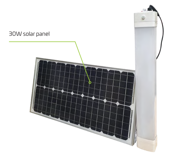
Frosted IK10 rated solar lens and lamp body